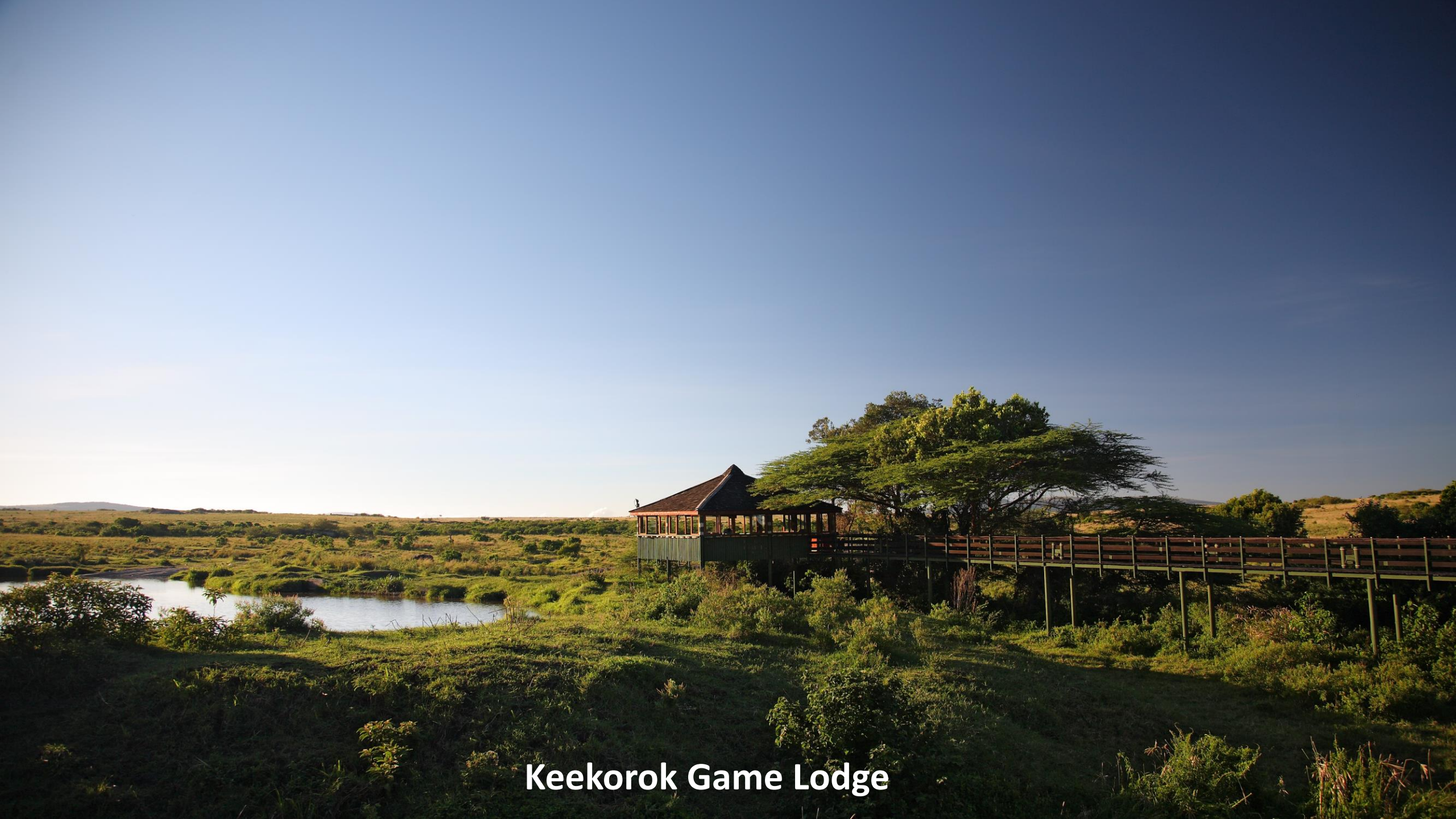
Keekorok Game Lodge