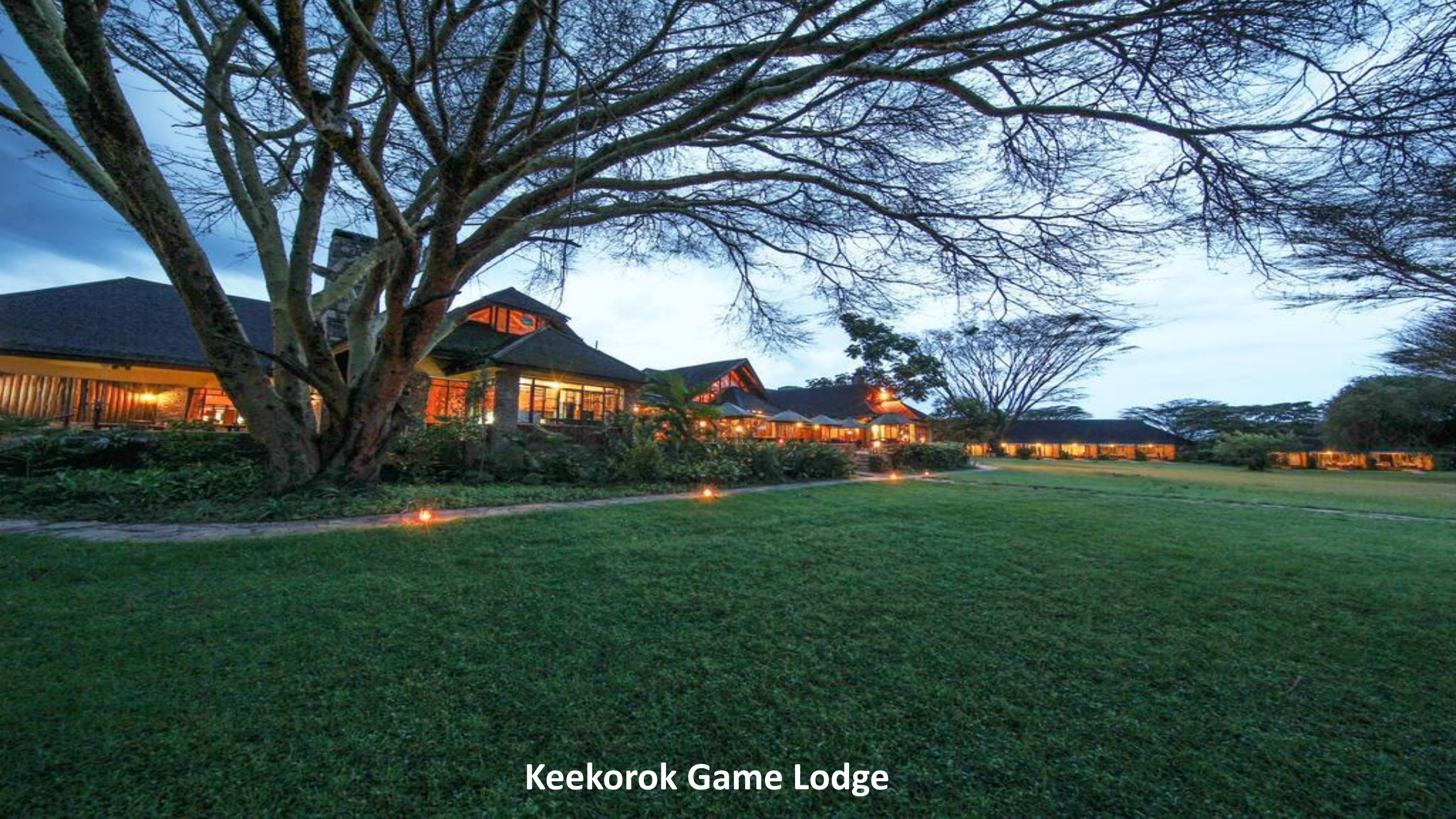
Keekorok Game Lodge