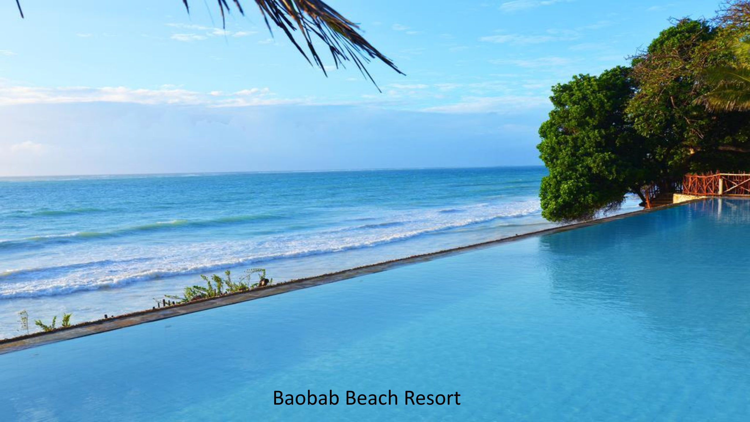
Baobab Beach Resort