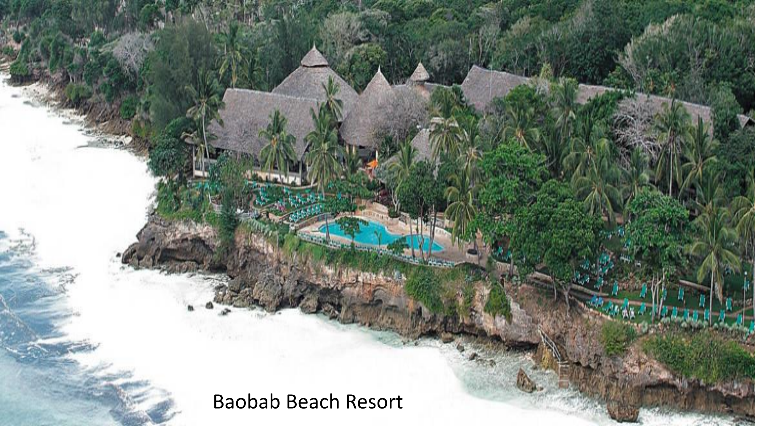
Baobab Beach Resort